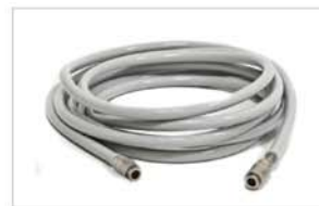
NIBP cuff airway