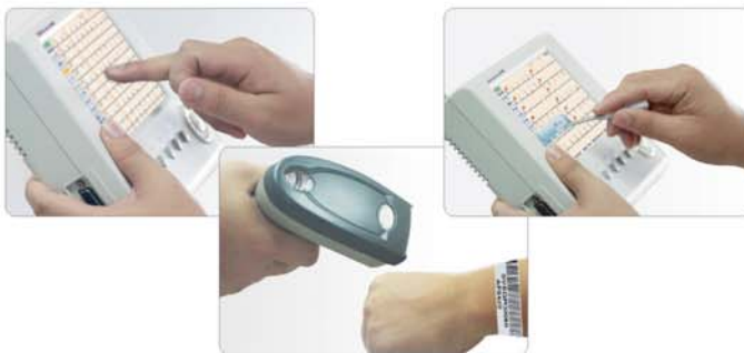
● Inputting: Touch-screen, Barcode scanner