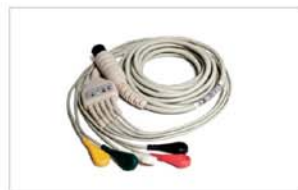
ECG cable of monitor