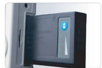
● Rechargeable long life Li-ion battery