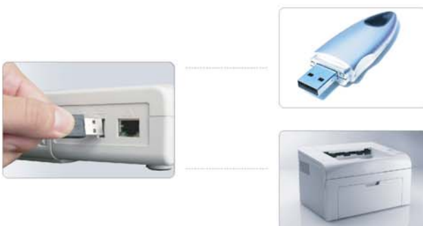
● Easy printer connection, data storage by USB